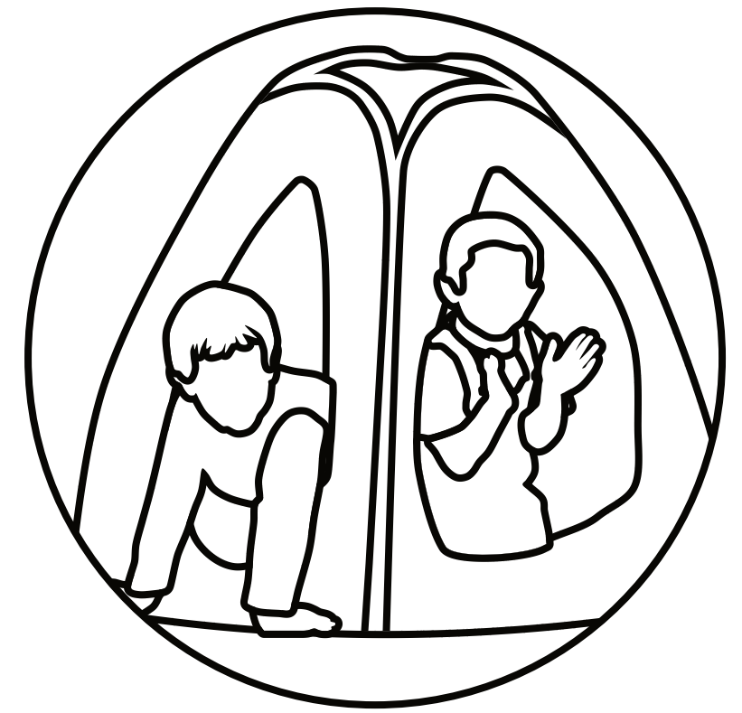
Waterproof / resistant tent

STEEP Sources, Transport, Exposure & Effects of PFASs UNIVERSITY OF RHODE ISLAND SUPERFUND RESEARCH PROGRAM